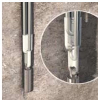
REHAU RAUGEO PE-Xa Probe Tip