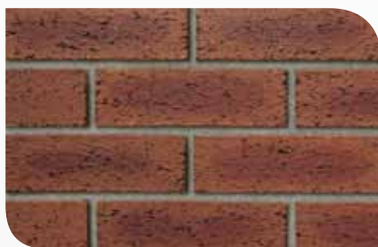
Hearted Red Rustic 3516