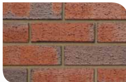
Roughdales Red Multi Rustic 3579