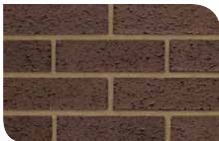
Bracken Brown Rustic 3505