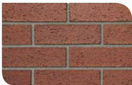
Ravenhead Red Rustic 3502