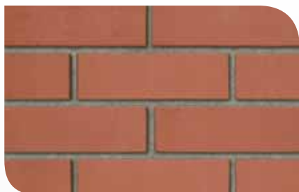
Ravenhead Red Smooth 3501

Our range includes carefully selected real clay brick slips that have all the beauty, durability and protection of a brick but in an easy to use tile format just 20mm thick. The decorative face of the brick slip has been designed to match the standard brick size of 65mm high x 215mm long.