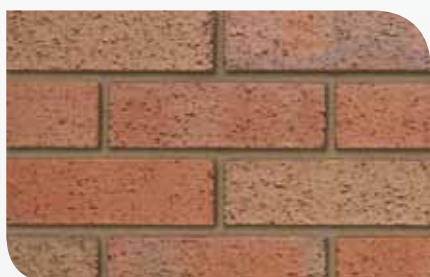
Trafford Multi Rustic 3576