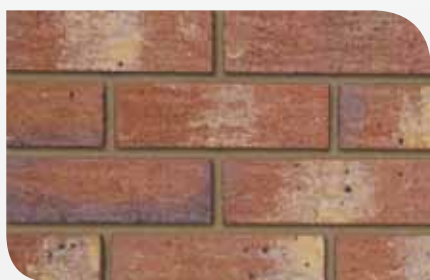
Calderstone Gold 3597

When you choose a brick from Ibstock, the UK's largest brickmaker, you can be confident that it has been made to the highest quality and environmental standards.... and with 19 factories nationwide there will be a brickslip that is perfect for your project.