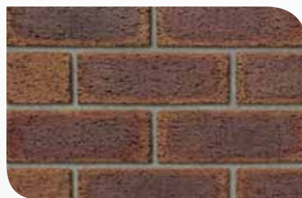
Oldcott Rustic 3532